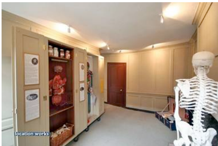
The Student Science Centre where children, with a little help from Stan the skeleton, can learn about the House's role in the history of medicine